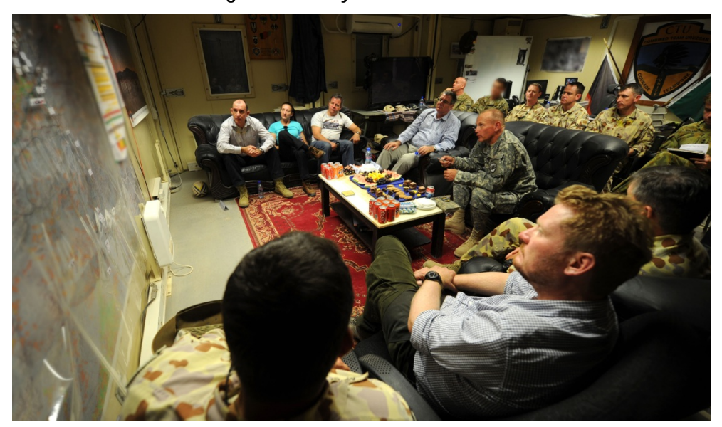
Figure 1.2: Delegation receiving an Operations Update at Combined Team Uruzgan HQ by its Commander COL Jim Creighton US Army